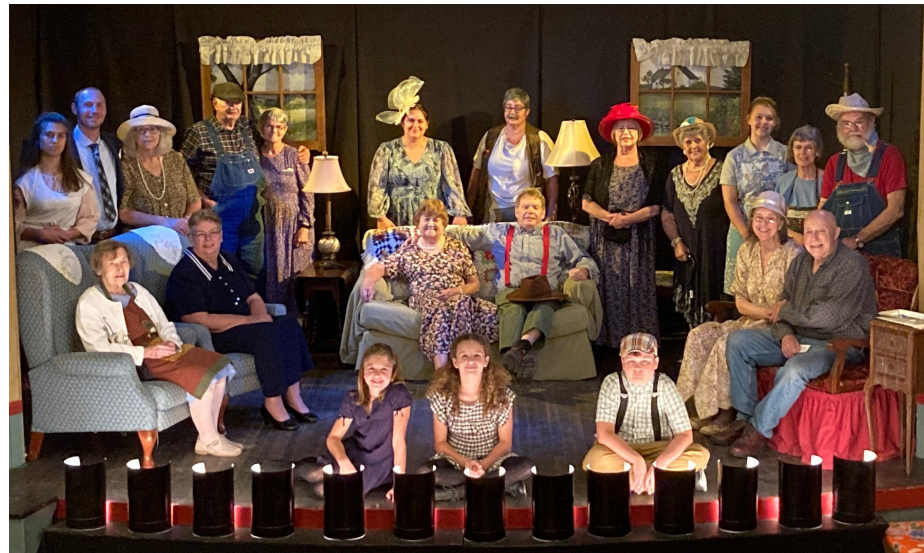
The cast of "A Romance in Vienny," presented by the Vienna Historical Society at the Union Hall in July