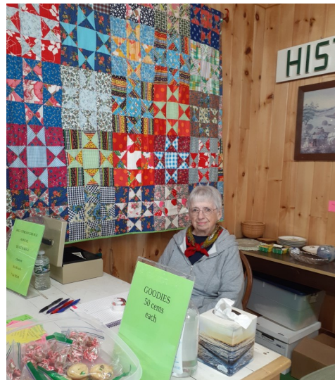
The Vienna Historical Society's booth at September's Franklin County Fair