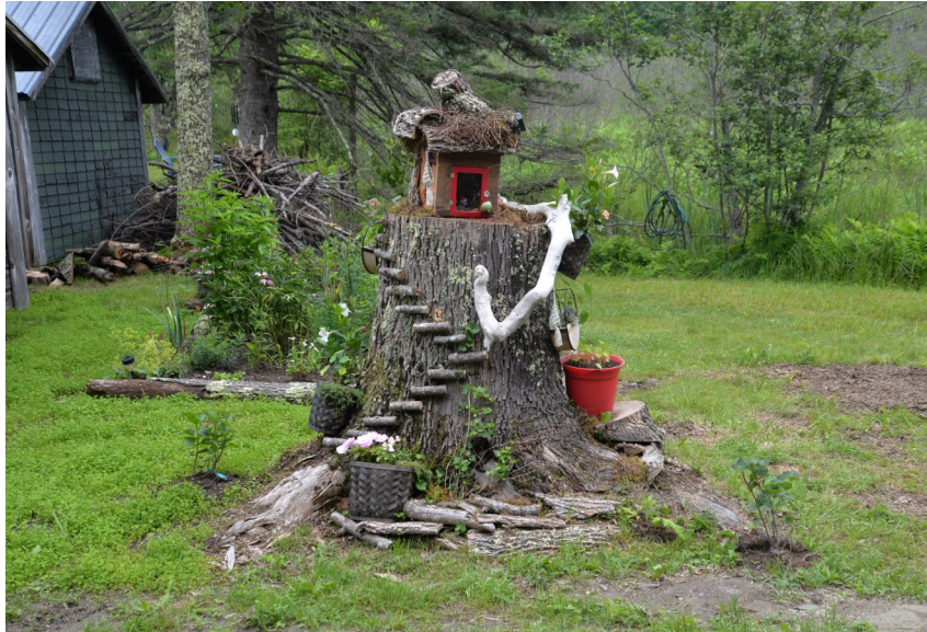
The new fairy house on Kimball Pond Road.