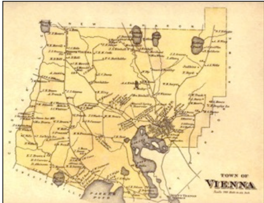
1879 Map of Vienna