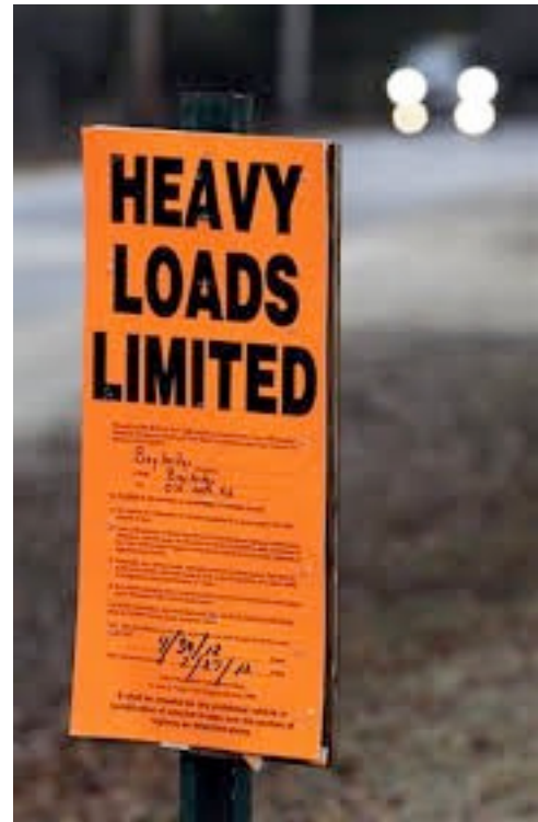
Welcome Maine’s Fifth Season Mud Season is the time of year when the thawing of winter turns dirt roads into mucky seas and paved highways into a frosty roller coasters sprinkled with potholes. But it really means spring is here at last!